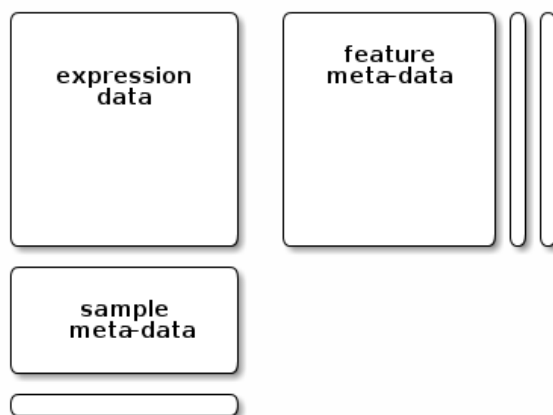
Figure 3: Dimension requirements for the respective expression, feature and sample meta-data slots.