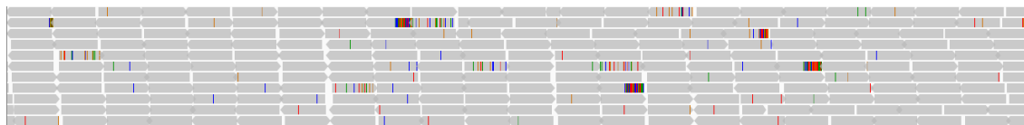
Figure 3: Simulated reads mapped in proper pair Mismatches and soft-clips are shown as colored vertical lines in reads.